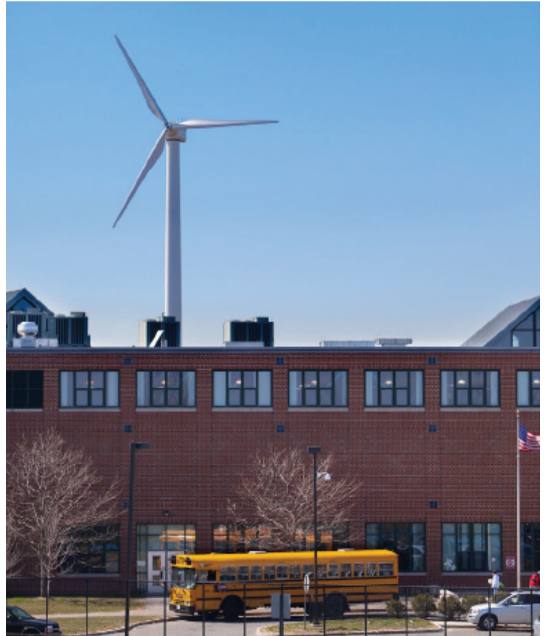
McGlynn Elementary & Middle School, with 100-kW turbine in background

The 100-kW turbine provides about 10 percent of the school's electricity, saving the city $25,000 annually. The turbine comes with a SmartView web monitoring program that allows the teachers and students to view real-time data on wind speed, energy output and carbon emissions offset. On an annual basis the wind turbine produces approximately 170,000 kWh and offsets over 100 tons of CO 2 .