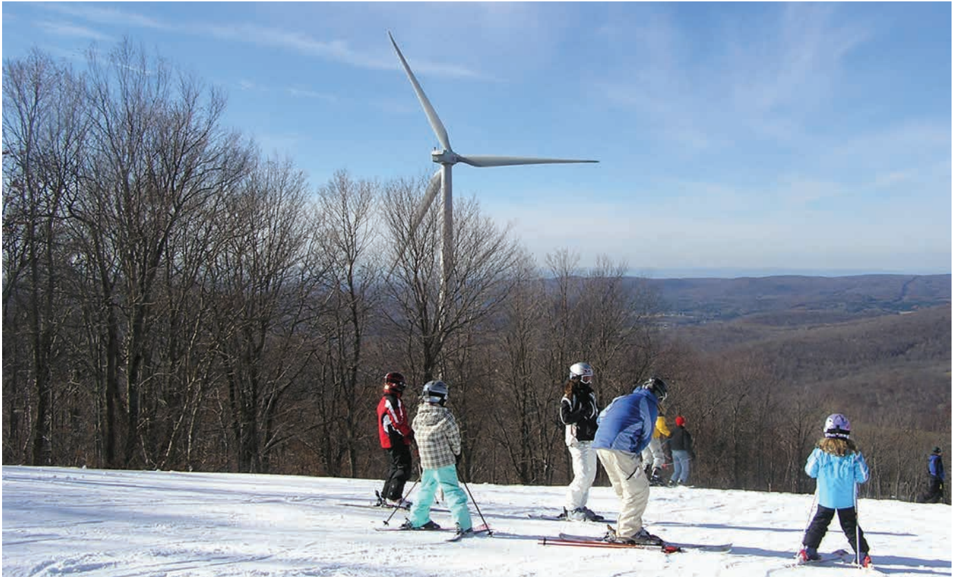
The “Zephyr” wind turbine at Jiminy Peak