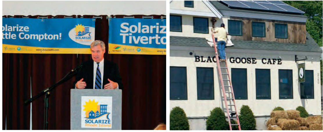
U.S. Senator Sheldon Whitehouse speaks at the Solarize Tiverton and Solarize Little Compton kickoff event

RI OER designed the pilot project's solar solicitation to fully integrate with and complement the state's Renewable Energy Growth (REG) Program, which helps Rhode Island customers develop and benefit from renewable energy projects by using fixed-price, long-term, performance-based