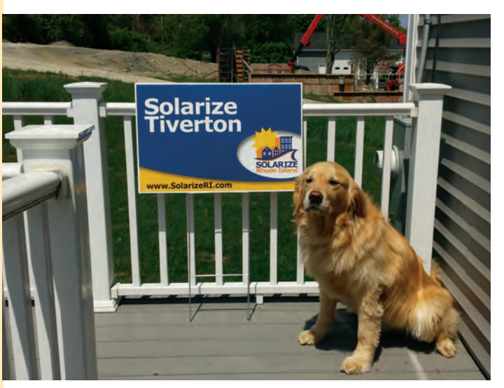
The Solarize initiatives engaged a wide array of local community members—even dogs got excited about solar!

incentives. RI OER offered a competitive grant opportunity to REG Program participants based on the incremental costs that might be incurred to maximize a solar installation's benefit to the distribution system. One developer submitted a proposal for a single-axis tracking system. The solar tracking system design helps maximize value to the distribution grid by providing increased electric generation during the late afternoon load peak when the area's load constraint is most acute.