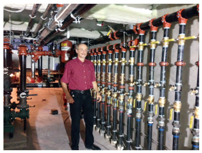
The Geothermal Distribution Room at 233 Vaughan Street, in Portsmouth, New Hampshire

state. The program requires electricity providers to secure renewable thermal generation equivalent to 1.3 percent of electricity sales in 2016, increasing gradually to 2 percent in 2023. This represents the first time a state has set a target within its RPS for thermal output. The useful thermal energy generated must be delivered in New Hampshire.